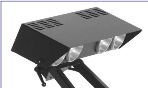
Quartz Halogen 5500 K