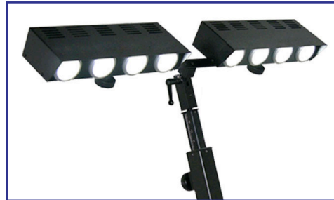
LED Illumination System