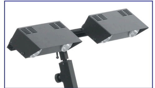
Quartz Halogen 3250 K